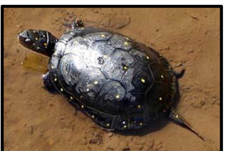
Spotted turtle (state threatened)