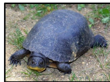
Blanding's turtle (state endangered)

TOTAL REQUIRED = 51 SPACES TOTAL PROVIDED = 41 SPACES